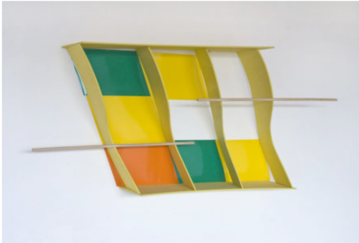
Elspeth Pratt Theatre 2009

Delicate pencil drawings by Sworn further underscore the disturbing social connotations of modern architecture. Simple captions, such as Boy in the Bubble 1974 and Germany 1972 , narrate her photorealistic depictions of a now-anachronistic utopian future. The results provide a restrained meditation on the loaded parallels between language and design, and between ideologies and architecture, that have ongoing resonance well into the 21st century. (235 Alexander St, Vancouver BC)